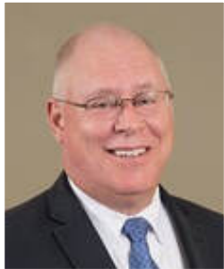
William Bowers Coastal Heritage