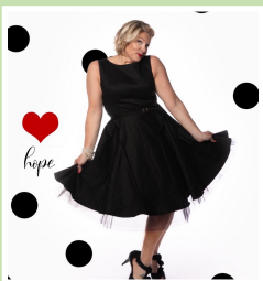
Patti Napolitano-Driscoll Patti Anne Photography